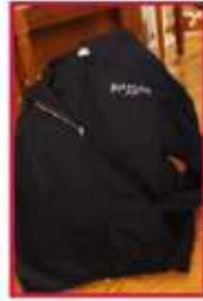
HOODIE $25 Adult Small-3XL

* Hoodie NOT Dress Code approved for daily wear