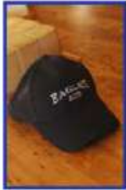
BASEBALL HAT $15 (One size fits all)

* Hoodie NOT Dress Code approved for daily wear