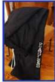
SWEATPANTS $20 Adult Small-5XL