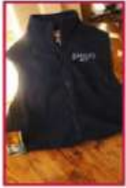
VEST $25 Adult Small-5XL