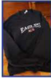
SWEATSHIRT $18 Adult Small-5XL