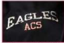
Up close of LOGO